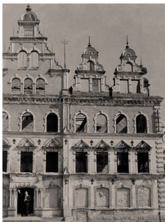
The destroyed building that used to be the Vyborg City Museum, 1945–1949.

21 March – 24 May 2020 Photographic Memories of Soviet Vyborg from the 1940s, 50s and 60s