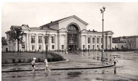
Railway Square after the rain, the 1960s. Photograph: E.N. Ichitovkina. Vyborg Castle Museum.

A photography exhibition focused on Vyborg from the 1940s to the 1960s. Produced by the Vyborg Castle Museum, the exhibition is made up of photographs that have entered the castle's collections from private archives. The photographs have been taken by professional photographers, architects, restorers, property developers and journalists. They tell stories of everyday life, the restoration of the city and the construction of new buildings. Following the Second World War, Vyborg became the "northern gate of the Soviet Union". Though the city was able to preserve much of its former image, that image would come to take on many Soviet aspects. Access to the city was restricted, due to its location in the border region. Because of this, much information about the city's history was lost, both in Finland and the Soviet Union. In the exhibition, we see Vyborg through the eyes of the people who settled there in the aftermath of the war.