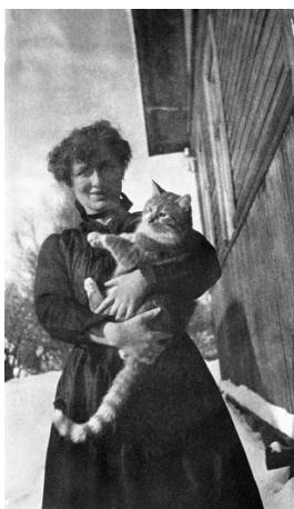
Edith Södergran and Totti, the 1910s.

From the 1860s to the 2020s, this exhibition reveals how photography has shaped our understanding of the eastern regions of Finland. During this time, through their photography, photographers have reacted to many different ideas, interests and styles that have cut across Eastern Finland, making the region rich in diversity and mythology. In the East captured in these photographs, nature and age-old myths collide with the aspirations of modern humans. This broad historical overview collects the most important photographers and the most significant photographs of Eastern Finland into one place. The exhibition contains approximately 100 photographs taken throughout a large geographical area stretching from Savo to Suursaari (Gogland) and from the northern shores of Lake Ladoga to Petsamo.