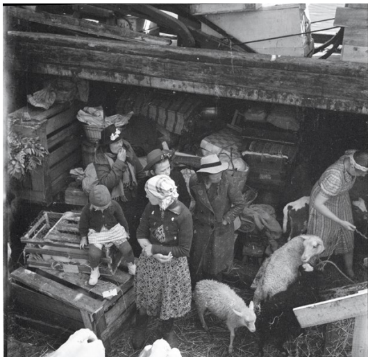
Cargo ships stuffed with the livestock and belongings of refugees in Vuoksenniska Harbour, 23 June 1944.

This exhibition opens up Finnish refugee history and puts it in context with broader refugee movements in Europe and across the globe. At the same time, it asks what it's like to be a refugee and what is the legacy of displacement. The story is told by both modern refugees and the refugees and evacuees of the 20th century. On display are artefacts, as well as oral and photographic memories of loss and starting anew. Some of these memories are broadly felt and commonly shared as part of Finnish national memory, while many others are small, seldom-heard snippets of family history.