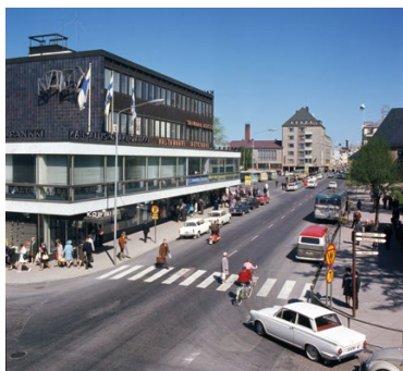
A view towards Valtakatu from the Kauppakatu crossroads, Lappeenranta, 1969, photographer unknown.

This photograph-centred exhibition will lead visitors on a nostalgic journey full of life from the 1950s to the 1990s, providing wonderful glimpses into everyday life in Lappeenranta during this period. Come and join the adventure!